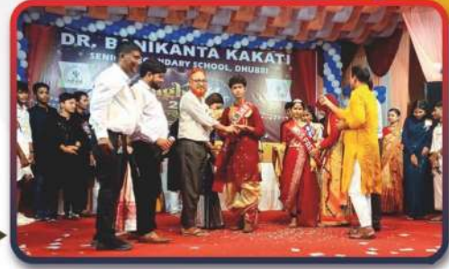
Freshers' Social Ceremony